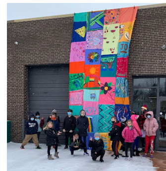
The students were proud of their finished project!