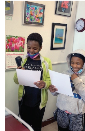
Getting the word out including making PA announcements at the Art House