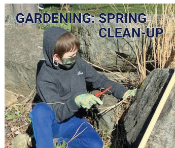
GARDENING: SPRING CLEAN-UP