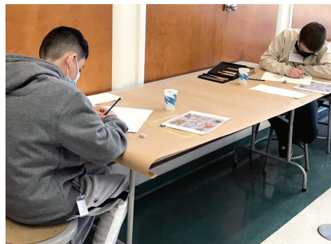
Social Distancing Requirements keep class size low.

In-person classes resumed March 1 with 40 students enrolled. Six piano students continue to take their lessons virtually. Students were so happy to be back to in-person classes that the quality of their art has been remarkably high.