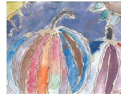
Soniya 9 Watercolor and glue