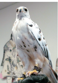
Red-Tail Hawk with near albino coloring