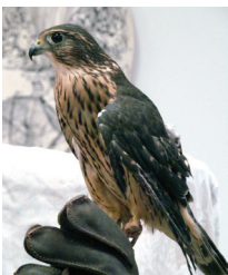
Jedi, Merlin Falcon