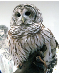
Sophia, Barred Owl

This assembly provided a perfect opportunity for Photography students to practice their skills.