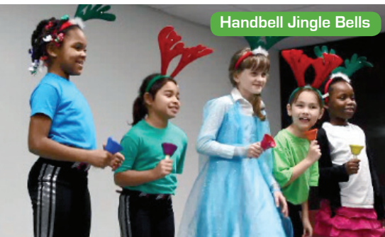
Handbell Jingle Bells