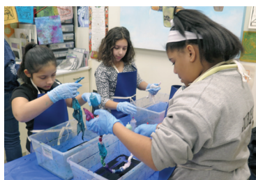
Dyeing over 200 bandanas - one at a time.