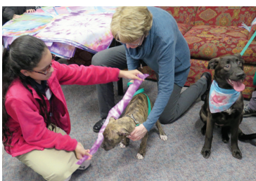
The visiting dogs each got to wear a bandana back to the shelter.