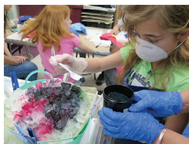
The fabric sensitive dye must be very carefully applied to the ice that covers the white fabric garment.