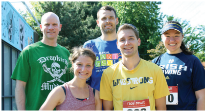
Team Challenge Winners, Gannon University