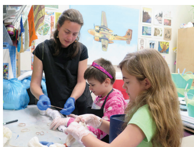
Using various patterns of folds, twists and rubber bands, the children prepared white tee-shirts, jumpers, skirts, and totes for the dyeing process to come.

The fiber reactive dye powders were then applied. As the ice melted, the color soaked into the fabric creating patterns and unpredictable color variations. Are these children proud of their new garments and totes? It's obvious!