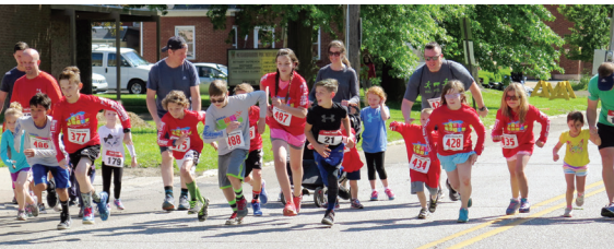
First ever Fun Run for Kids