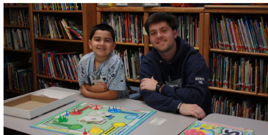
Our students love having volunteers help in class, Hooked on Books, and tutoring!