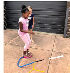
There is an equal and opposite reaction!