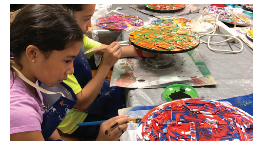
During their art experiences, students took apart old computer DVD drives to create land rovers and futuristic planets.