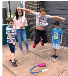
For every action . . .