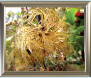
Yana S, age 11; photography, Women’s Clubs – State Level, First Place