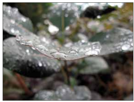
Photo by Kiersten Lohse received a 2nd Place award in the Division 2 Photography category

Division 1 (Grades 4-6) SECOND PLACE: Auriasia Dunn Division 2 (Grades 7-9) SECOND PLACE: Kiersten Lohse