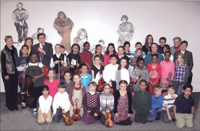
Neighborhood Art House children and teachers gathered for this group photo following the Winter Music Recital

In every community there is work to be done. In every heart there is the power to do it. -Marianne Williamson