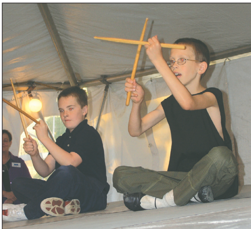
Neighborhood Art House children perform for the guests.